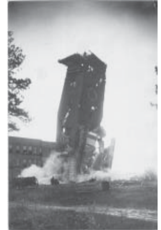
Destruction of the old Normal School tower following the fire of 1912.