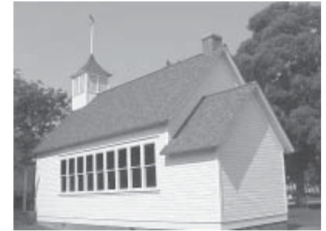
The Jore School at its new location on the EWU campus, 2002.

Originally located approximately eight miles west of Newport, Washington, this one-room school was moved to the EWU campus in 2000, as a memorial to the teacher-training origins of the university. Many of the teachers trained by the Cheney State Normal School taught in similar buildings. In 1914 this school was used as a 'model' one-room school for student teaching by students at the Cheney State Normal School.