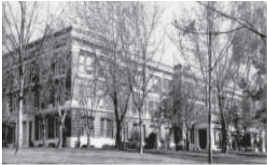
Showalter Hall.