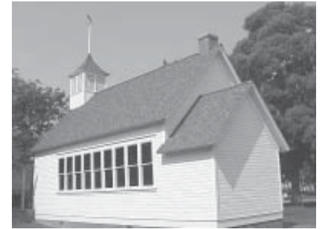
The Jore School at its new location on the EWU campus, 2002.

Originally located approximately eight miles west of Newport, Washington, this one-room school was moved to the EWU campus in 2000, as a memorial to the teacher-training origins of the university. Many of the teachers trained by the Cheney State Normal School taught in similar buildings. In 1914 this school was used as a 'model' one-room school for student teaching by students at the Cheney State Normal School.