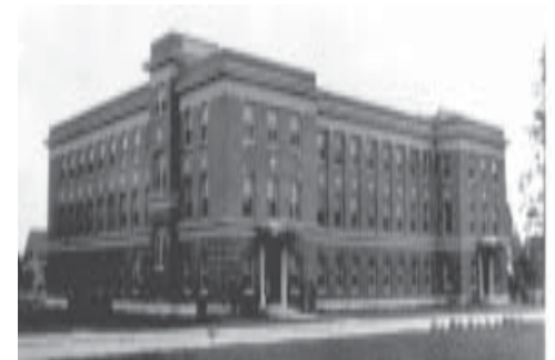
Senior Hall.

Each of the building’s sides exhibits an appearance similar to the front facade, including windows, skirt, stringcourse, cornice, and parapet. The primary difference is in the two stairwell towers, one on each side. These project out several feet from the main walls and are higher than the rest of the building. Correspondingly, the windows, stringcourse, and cornice are all raised. There is a small casement window at the bottom of each tower.