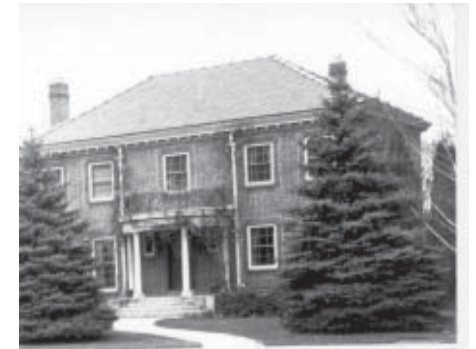
University House.

This is a two-story red brick structure employing elements of both Colonial Classical and Georgian styles. Its moderately pitched hipped roof, originally covered with red tile, is of composite material. Boxed ivory-colored wooden eaves are decorated by a line of dentils.