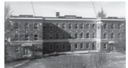
Monroe Hall.

Monroe Hall is a three-story red and brown brick structure with flat roof, featuring Classical and Renaissance Revival elements similar to other early campus buildings. The original plan, calling for a U-shaped structure approximately 130 feet across the facade with 110 foot wings, was similar to that used later for Senior Hall.