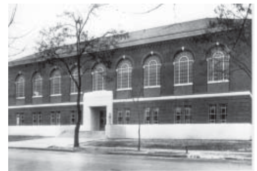
Hargreaves Hall.

This Romanesque Revival building is constructed of steel reinforced concrete with red brick cladding. Originally constructed as a library, and since remodeled, the building displays features reflective of its earlier function. The plan is in the shape of the letter "T," with small wings in the inner corners. At the top of the "T," the main portion of the building measures 150 feet by 44 feet. It is forty feet high, plus the height of the moderately pitched hip roof. The roof was originally sheathed in red tile which was replaced by red composition shingles in 1968.