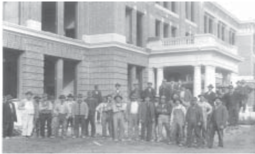
Showalter Hall Construction, 1913, showing Senator W. J. Sutton (3rd from right, in bowler hat). Senator Sutton was instrumental in securing funds to rebuild the Normal School following the fire in 1912.

From the outset, it was determined that all materials used would be from Washington State, if possible. Except for the Alaskan marble, the builders succeeded in fulfilling that policy. On June 27, 1914, in a large ceremony presided over by Senator William J. Sutton and Governor Ernest Lister, two cornerstones were laid. One had been salvaged from the ruins of the previous Administration Building, the other commemorated the new building. Beneath the latter was placed a time capsule consisting of a copper box containing contemporary documents and newspapers.