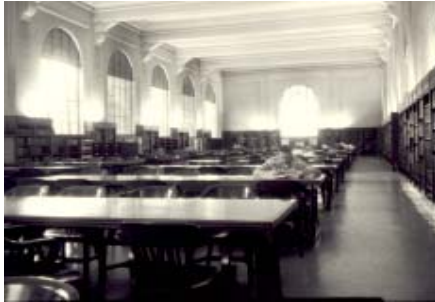
Hargreaves Hall Reading Room.

dimensions were 146 feet by 40 feet. It could accommodate 280 students seated at 28 twelve-foot, Bank of England type tables. Along the walls were built-in hardwood bookshelves, many of which survive. The 27 foot-high room was dominated by the great round-arched windows, which employed blue tinted glass to lessen the glare of sunlight. All that remains of this picturesque room are the divided windows and some of the built-in shelves. In 1967 a new concrete floor was installed in this room, which divided it into two levels. The resultant space was further divided into offices and classrooms.