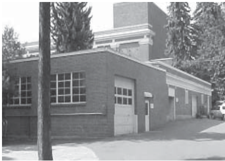
Plant Utilities Building.

The new Rozell Heating Plant replaced the heating plant function in 1967. Since then the building has been used for storage and other maintenance purposes. An original 104-foot concrete chimney was removed in 1973.