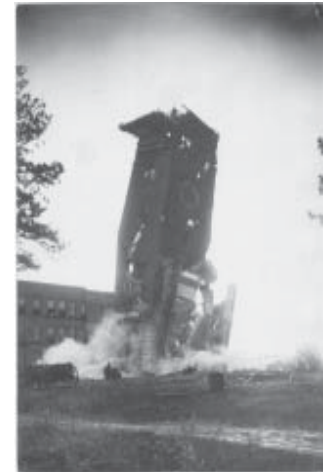
Destruction of the old Normal School tower following the fire of 1912.