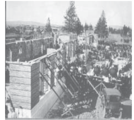
Senior Hall construction, 1918.