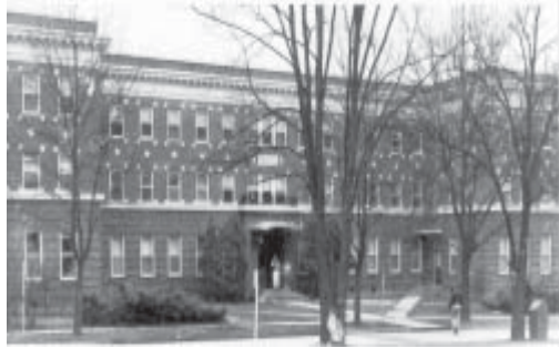
Sutton Hall.

In the rear of the building are two one-story extensions which complete the “H”. These both have flat roofs with metal coping, lacking the cornice and stringcourse of the main section. Above these the main cornice wraps around the rear of each wing. Windows facing the rear courtyard are mostly sets of four double-hung wood sash