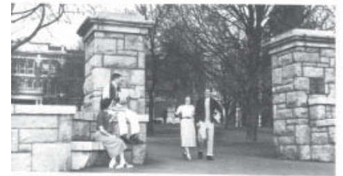
The Herculean Pillars were built of stone salvaged from the original Normal School Building. The monument was a gift to the college from the class of 1915.

A walkway leads north from the pillars to the main entrance of Showalter Hall. The pillars and attached benches are constructed from rough-faced granite blocks of various sizes salvaged from the rubble of the old Cheney Normal School building which burned in 1912. Two twelve foot high square pillars flank the walkway, each with a square stone capital. Metal plaques on both pillars read "Erected by the Alumni Association and Students - 1915." Each pillar has an adjoining wall with semi-circular section, concluding with a stone pier. The semi-circular portions of the wall contain curved granite benches.