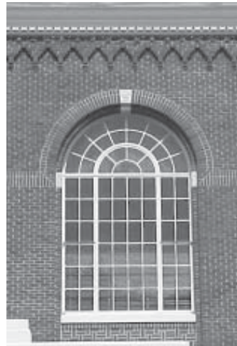
Window Detail, Hargreaves Hall.

The rear section of the building, forming the stem of the “T,” is 33 feet high, with