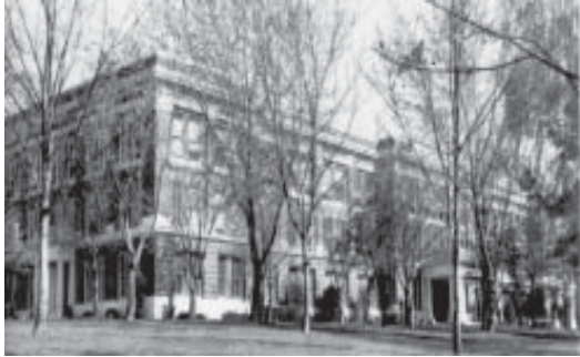
Showalter Hall.