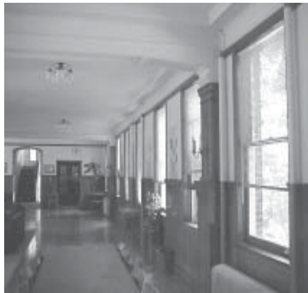
Senior Hall 2nd Floor Lounge.

The most impressive room of Senior Hall is the second floor lounge, situated at the bottom of the “U” between the two wings, where the front and rear windows provide ideal lighting during the day. This large room has maple floors and wood paneled entry ways with wood segmental arches. Again, dark red hardwood is used around the windows, in the paneled wainscoting, and the pilasters and stringcourse below the coving of the ceiling. Centered on the east wall is the original hearth with brick fireplace and wood mantle. The lounge once housed the dormitory radio and served as the social center for residents of the hall.